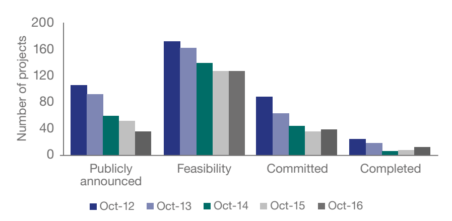
Figure 1.1: Number of projects in the investment pipeline, 2012 to 2016

The following Figure 1.1 demonstrates number of projects in the investment pipeline from 2012 to 2016: