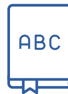
Early Childhood Teacher

Browse through the detailed role profiles in this resource to learn more about: