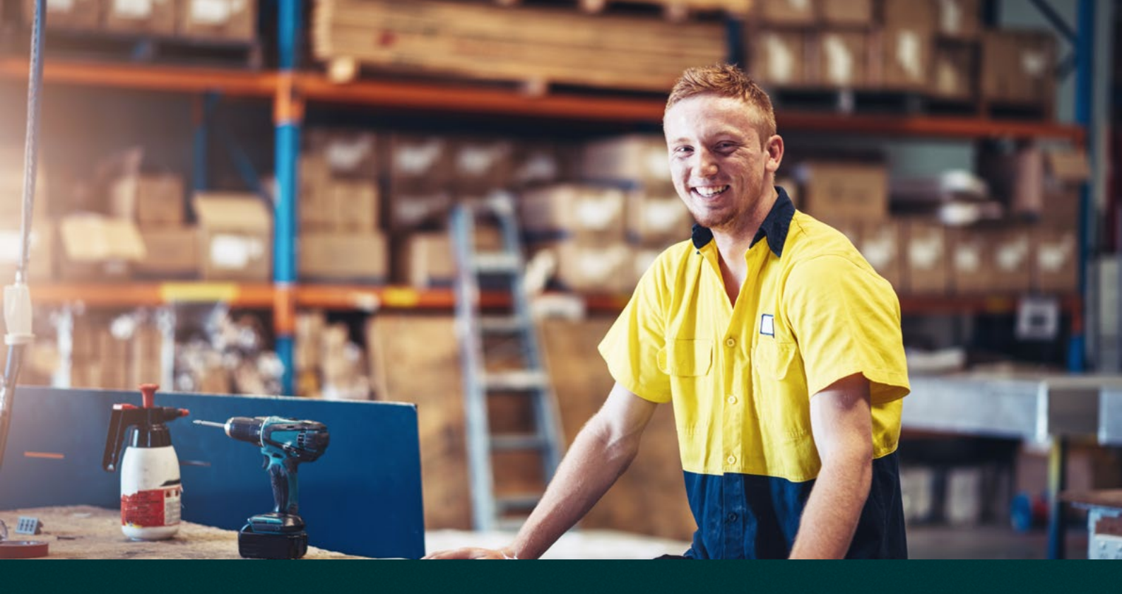
Figure 1 - National priorities for skills reform